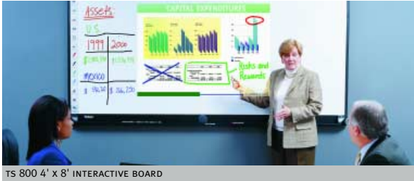
TS 800 4' X 8' INTERACTIVE BOARD